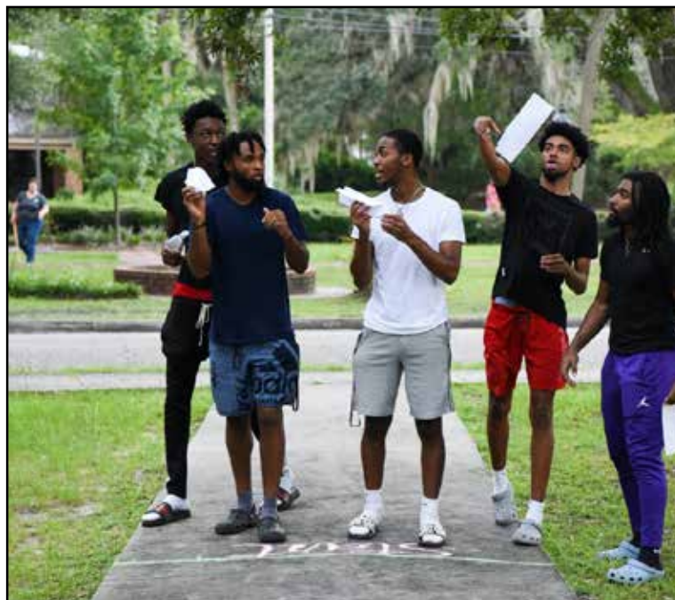
As part of their “Amazing History Race,” student-athletes at USC Salkehatchie participated in activities that taught them aspects of Carolina Lowcountry history. In one of four challenges, students (above) designed and flew paper airplanes inspired by the World War II-era Tuskegee Airmen who completed part of their training at a Walterboro, S.C., airfield.

The winners of the Amazing History Race were: